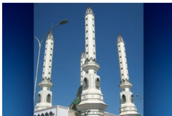
Grand Mosque in Cilegon.

Several months later, however, church members are continuing to encounter resistance. The process for obtaining a church building permit has proven onerous, involving multiple levels of government. Organizations opposing the construction have made it clear that they will dispute the establishment of any church building in the city. One opponent points to an agreement from 1975 stating that no worship facilities will be constructed in Cilegon except mosques. As of 2019, there were 382 mosques in the city, which consists of about 450,000 residents, but no place of worship for any other religion.