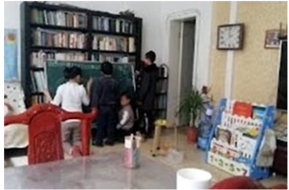
Inside the Linfen Covenant House Church.