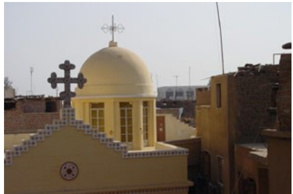
A church in Egypt.

Praise God for the ongoing changes that have been implemented over recent years to improve the treatment of Christians in Egypt, even though the progress made thus far has been slow and steady. As a result, may relations between Christians and Muslims in local areas improve considerably as well, and may leaders representing the country's various levels of government continue to take positive measures for the promotion of peace and equality. Finally, pray that the approval process of the remaining church applications will be streamlined to prevent any further unnecessary delays.