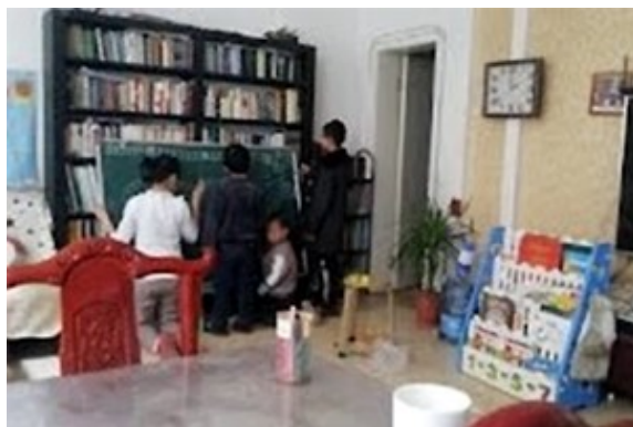
Inside the Linfen Covenant House Church.