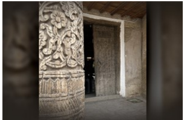
Pray for wisdom as UbeK Christians gather.

Church members say that the raid followed their attempts to rent local halls for a presentation of the Christian faith to commemorate Easter. Visiting German musicians were to be involved in these services, but all rental attempts were blocked. The next day, police raided another worship service in the city of Denov, where the musicians from Germany were performing. The authorities claimed that the meeting was illegal and forced those who were present to disperse. While the music group had intended to visit other various locations of the country, there were concerns that the arrests may have taken place due to the presence of the travelling team.