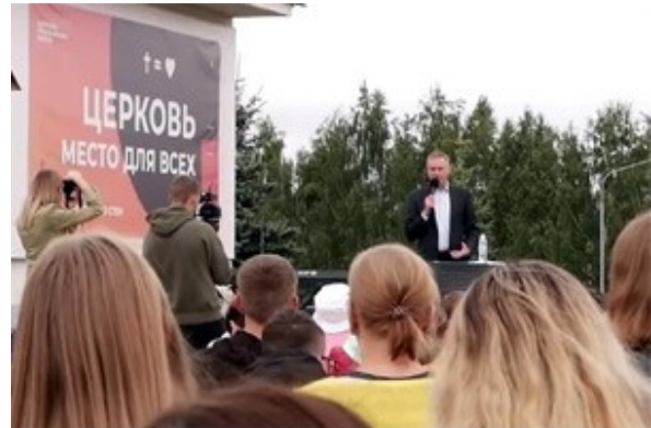
New Life Church outdoor service

Five of the seven Christians who received charges are members of the New Life Church, which has faced repeated incidents of persecution over the years and was sealed by the authorities in February 2021. For details on the challenges encountered by this church, along with other reports addressing the persecution of believers in Belarus, go to our country report .