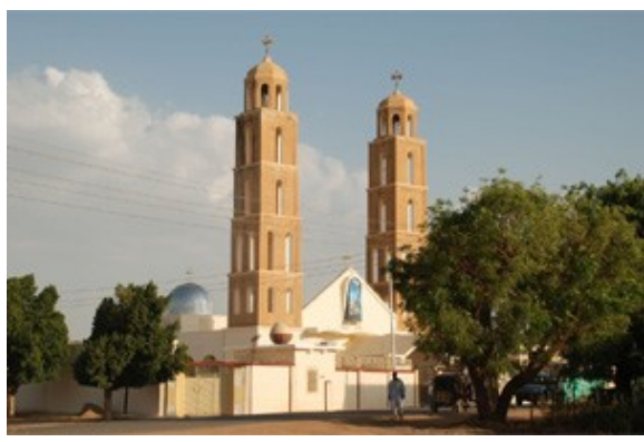
A Coptic church in Sudan.

During the attack, the assailants reportedly stormed the church building, calling those present "infidels" and "sons of dogs," and ordered the Christians to convert to Islam. They then demanded money, before proceeding to loot and damage the building. While the attackers wore scarves to conceal their identities, witnesses have stated that some of them were wearing uniform items from the Rapid Support Forces (RSF), a paramilitary group that is presently fighting against the Sudanese Armed Forces (SAF). These two parties have been battling for control of the country since April 15th. However, both sides of the conflict deny any involvement in this particular incident.