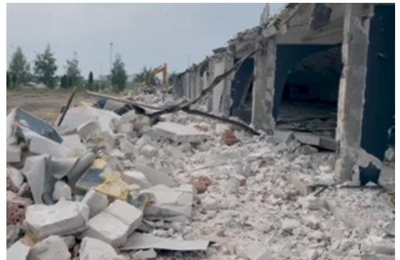
Destruction of the New Life Church building.