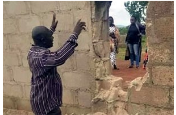
Prayers at a breach in the school's walls two years ago.