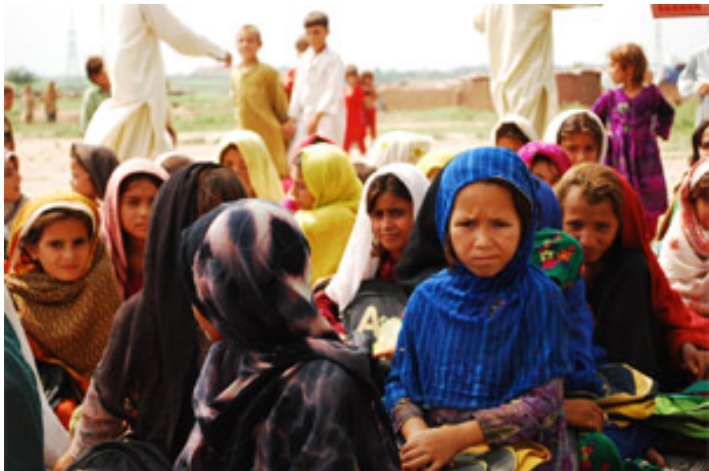
Afghan refugee children.

In mid-July, more than 150 individuals were rounded up from public areas and deported. The group included men, women, children, as well as the elderly. In many cases, families have been torn apart. Among those deported were Christians; other believers managed to flee to safer regions within Tajikistan. The reason for the sudden change in policy remains unknown, though some suggest that the decision may be